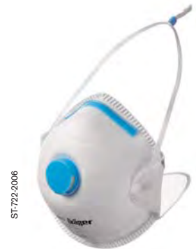
Dräger X-plore® 1300